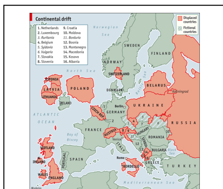
Fig. 1a. Continental drift The Economist 24May2010